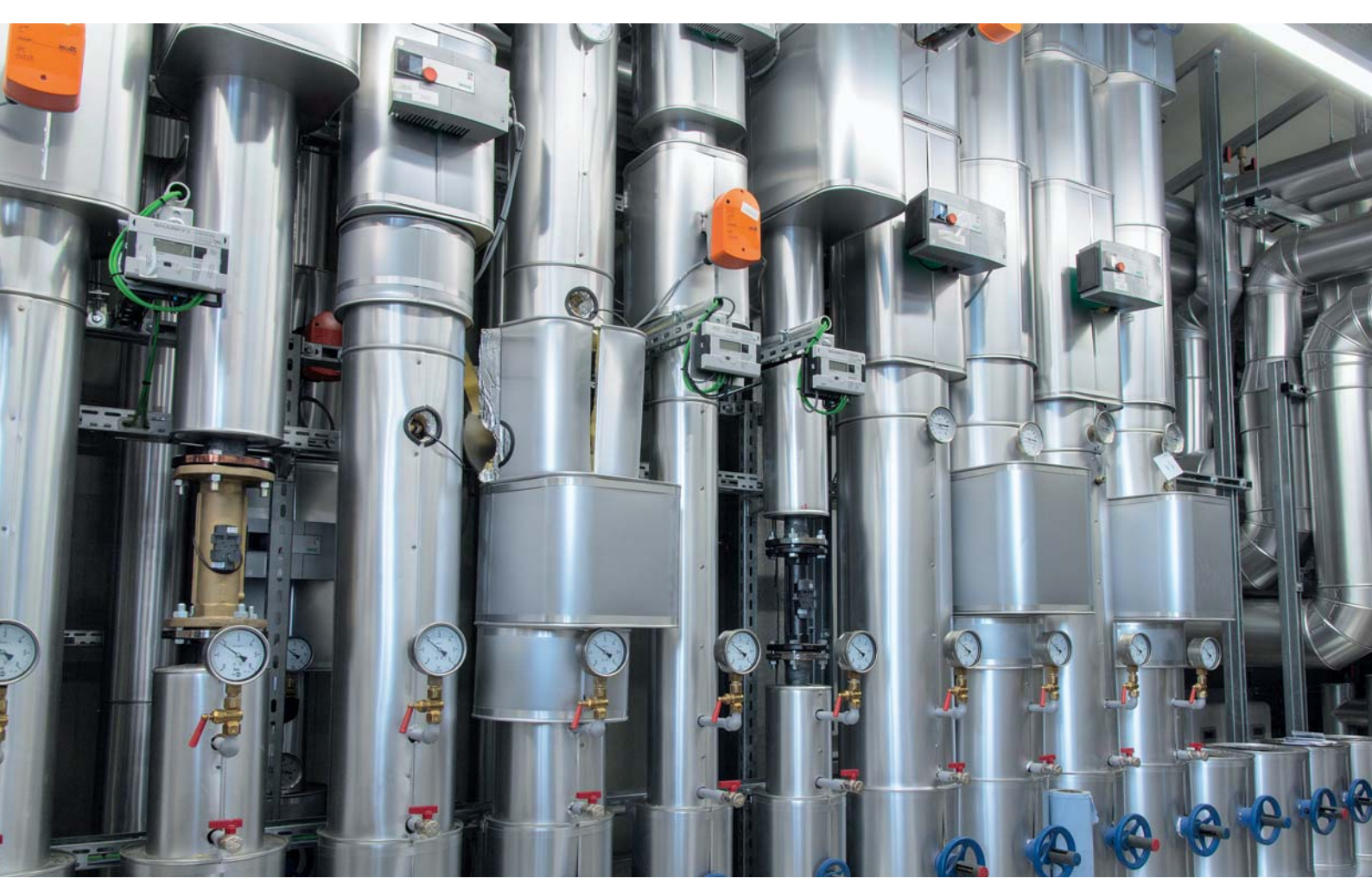
The Hermos energy center in Mistelgau, Germany is also used as a research facility and is currently being expanded with a battery storage system.

PC-based control for heat and energy supply